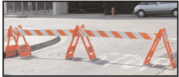
BARRICADES IN A-FRAME PARADE BARRIER APPLICATION