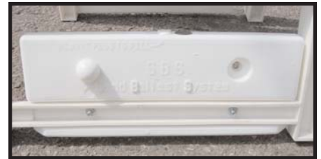
AVAILABLE WITH SAND BALLAST SYSTEM (SBS)